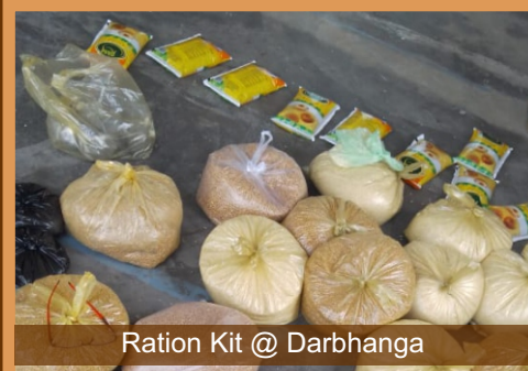
Ration Kit @ Darbhanga