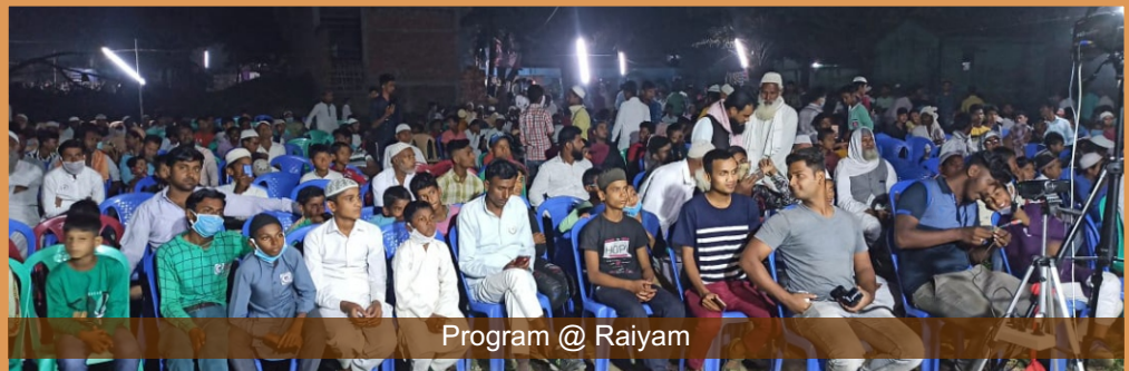
Program @ Raiyam