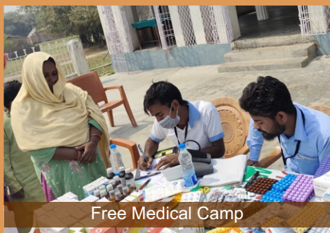
Free Medical Camp