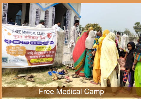
Free Medical Camp