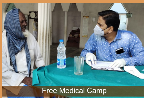
Free Medical Camp