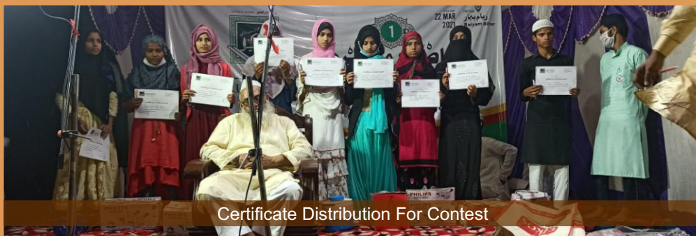
Certificate Distribution For Contest