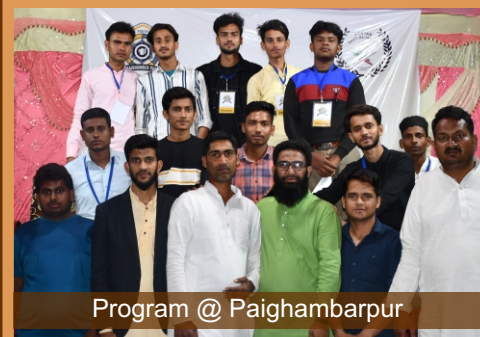
Program @ Paighambarpur