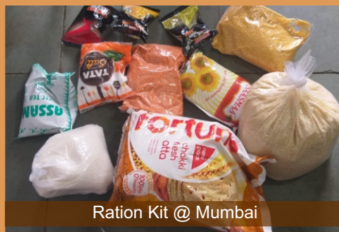
Ration Kit @ Mumbai